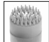
1 Attachment Stimulating Massage Attachment